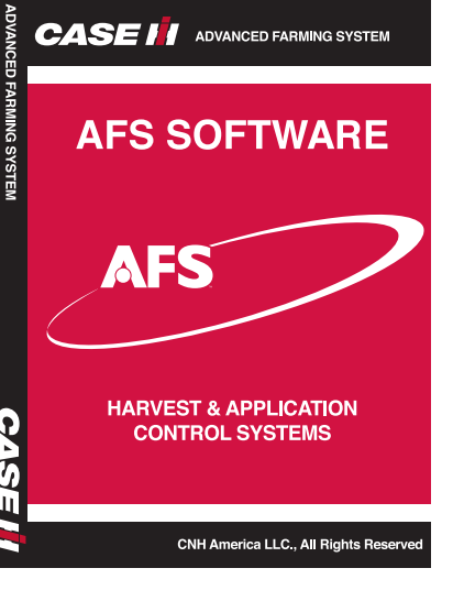
Import and export AFS AccuGuide autoguidance field patterns.